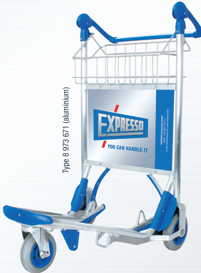
Type 8 973 671 (aluminium)